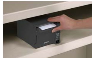
Front-facing operator controls

©2013 Epson Singapore Pte Ltd. All Rights Reserved. Reproduction in part or in whole, without the written permission from Epson, is strictly prohibited.