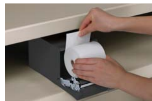
Front paper feeding with drop-in paper roll